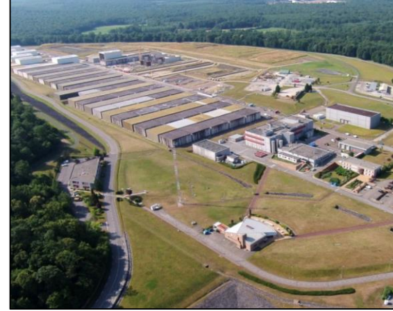
Near-surface: Centre de l'aube, France