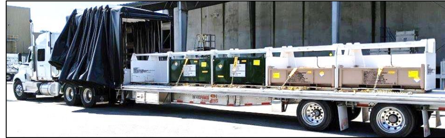
Special DSTAR packages were built for Refurbishment project.