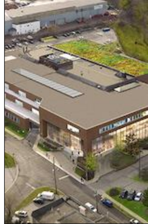
Research laboratory at McMaster Innovation Park – a partnership between OPG subsidiary Laurentis Energy Partners, and McMaster University – opened in 2020