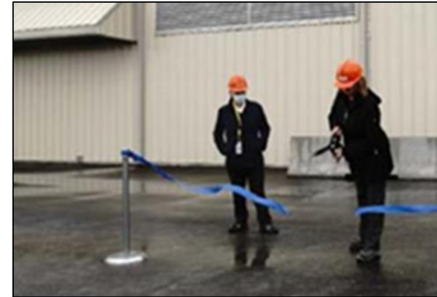
Ribbon-cutting at Pickering's Storage Building 4, completed in 2020.