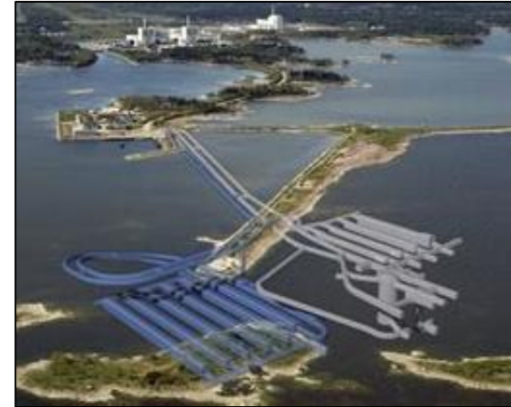
Deep repository: Forsmark, in Sweden