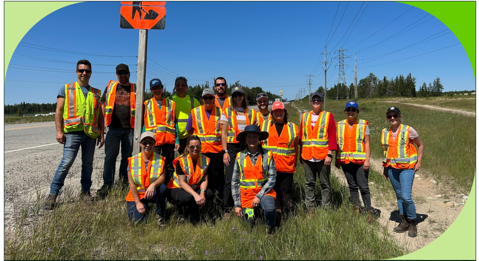
Timmins staff clean up the highway