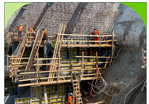
Form work at Pier 10 at Frederick House Lake Dam