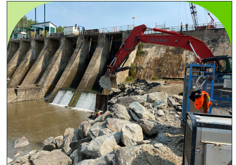
The Frederick House Lake Dam Rehabilitation Project began construction in summer 2023

undergoing a rehabilitation, involving repairs to the concrete, and replacement of stop logs, gates, and other equipment. Abitibi Canyon GS is currently undergoing projects such as a transformer roof replacement and unit refurbishments, and Otter Rapids GS is seeing much activity, with unit refurbishments and sluice gate upgrades. Further south, on the Matabitchuan River, Matabitchuan GS is gearing up for a redevelopment project, set to begin in 2025. All of these projects speak to OPG’s commitment to safety, and ensuring that our assets can continue to control water and generate power for generations to come.